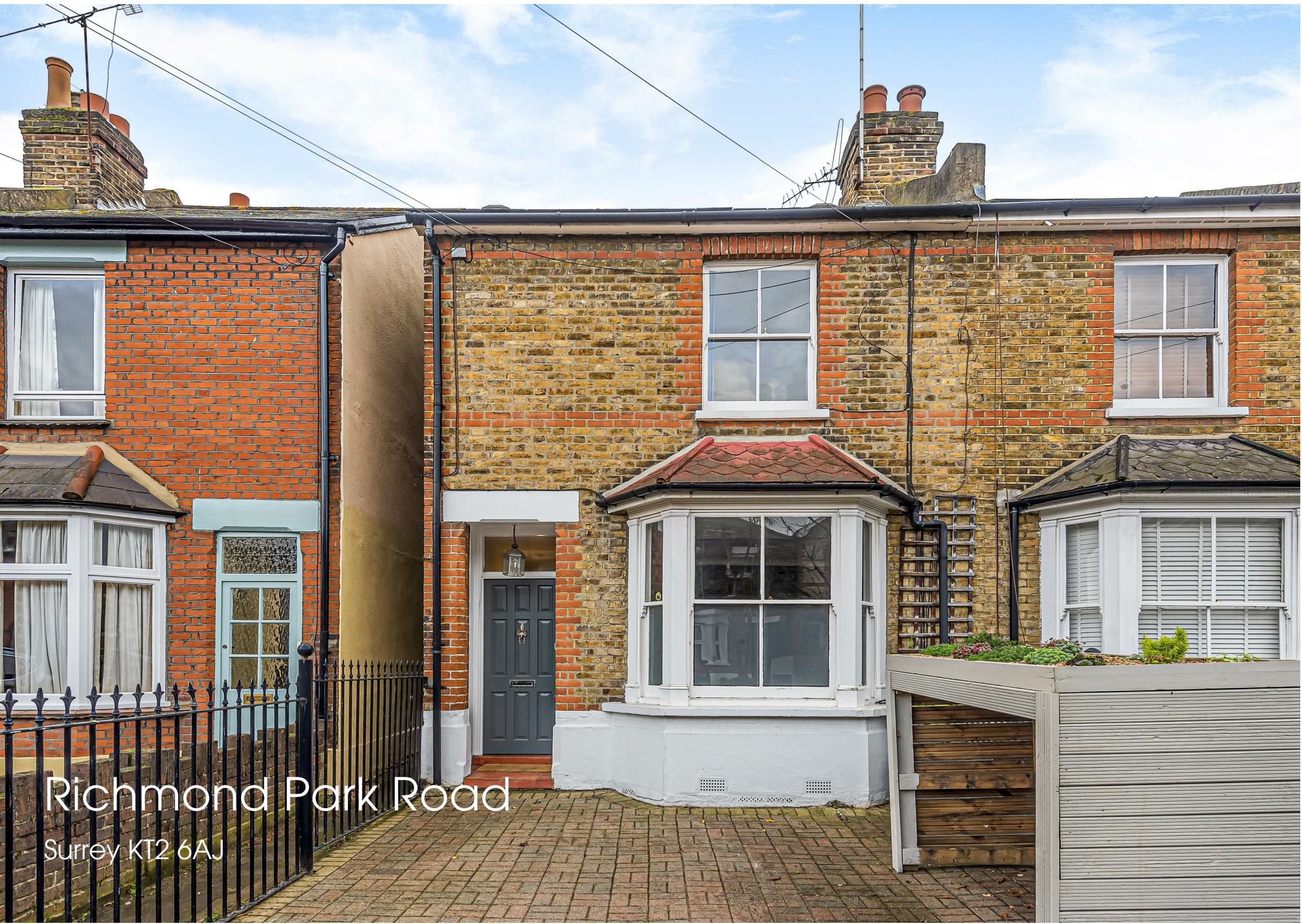
Richmond Park Road Surrey KT2 6AJ