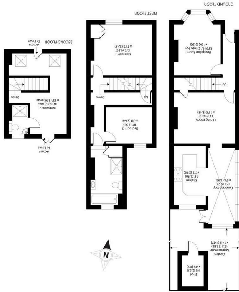
APPROX GROSS INTERNAL FLOOR AREA 1301 SQ FT 120.9 SQ METRES (EXCLUDES SHED)

34 Richmond Road Kingston upon Thames Surrey KT2 5ED www.gibsonlane.co.uk Tel: 020 8546 5444